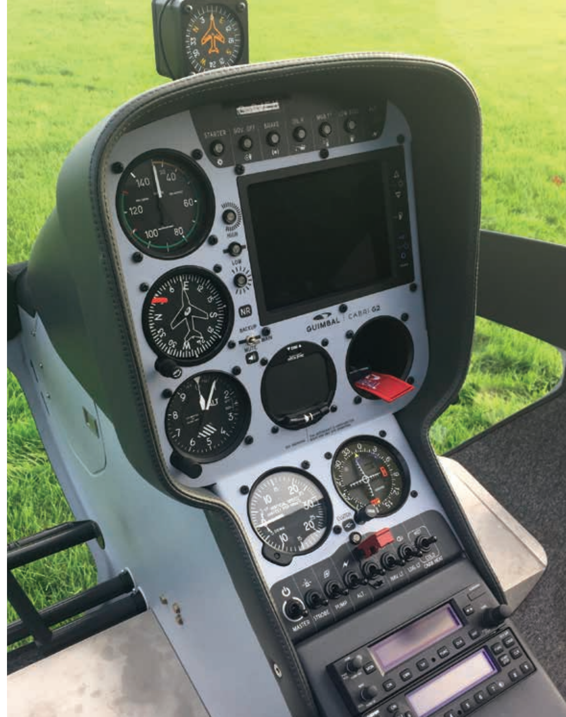
677 Series featured in helicopter control panels